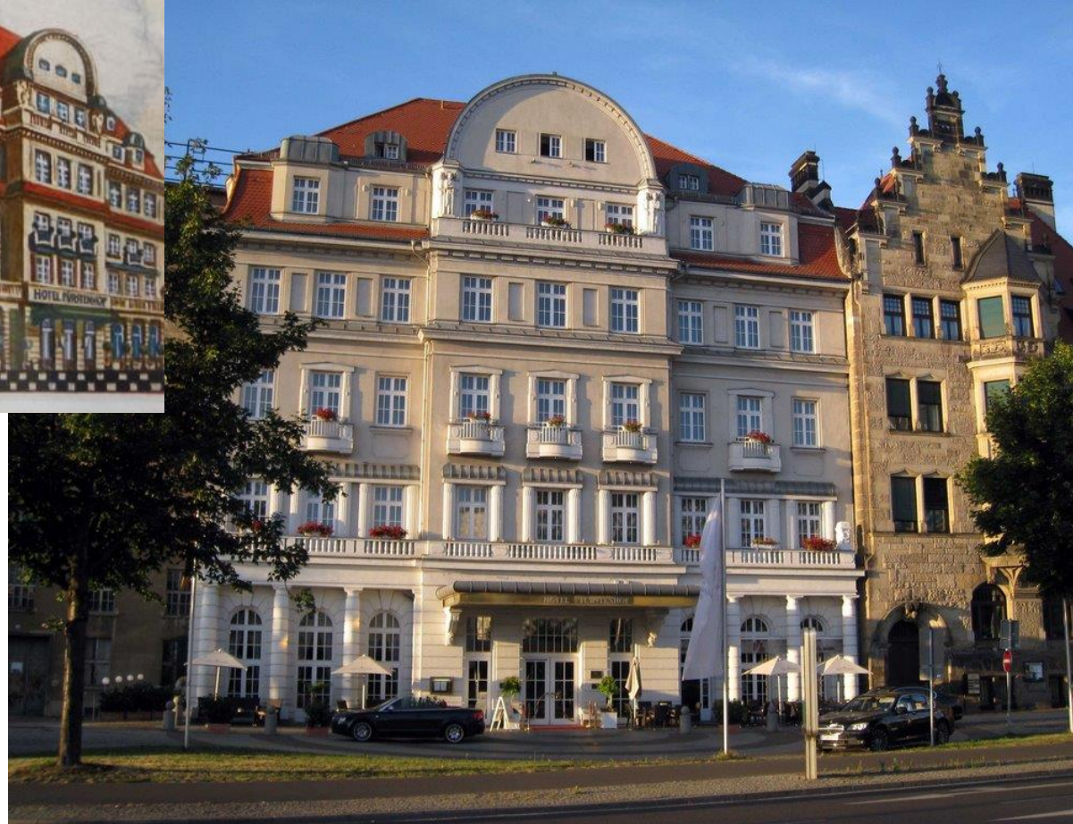
Hotel Fürstenhof RC Leipzig Meeting Point